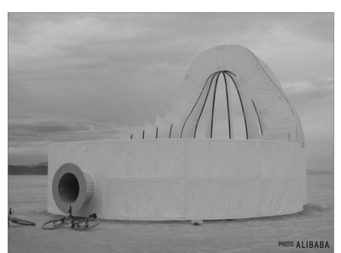
Bikes await riders at Johnny on the Spot

Around 3 pm on August 26, with tales beyond belief and a smile upon my face, I arrived at the Black Rock Desert. After riding my bicycle for over 3,000 miles, I finally arrived at Burning Man. It felt great to be home.