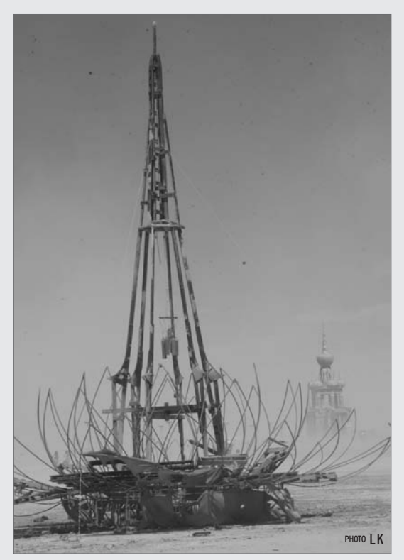
The messy aftermath of the Tear Drop burn. Intact Temple in background.

To volunteer for the Artery Team, aim your browser to www.burningman.com/participate/volunteer.html.