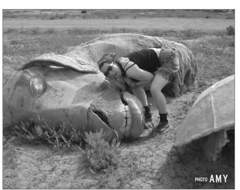
Goatie! Goatie! Speak to me!

Where is this all leading? Stay tuned for the next livestock report in the BRG and on playa in 2004.