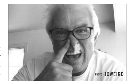
It's never too early to get ready for next year.