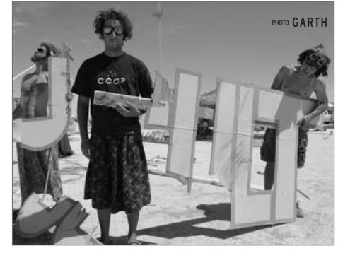
Dude, you wrecked my sign!